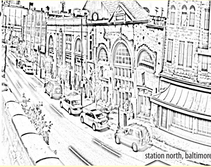
station north, baltimore